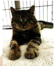
Fig is a very sweet and loving girl who needs an owner who can monitor her weight. Although she lost her left eye as a kitten, this does not affect her at all. She has had a dental and most of the teeth were extracted, but she doesn't let that slow her down either! She gets along with other cats and loves to be brushed. Born in 2015.

Sasquatch - Gotta love those cheeks! This cute tabby boy is a major love bug and a great cuddle buddy! His owner passed away suddenly so he and his housemates had to find another home. He would prefer to be an only cat so that he can have all of the attention to himself! Sasquatch is FeLV negative/FIV positive and date of birth is approximately 2019.